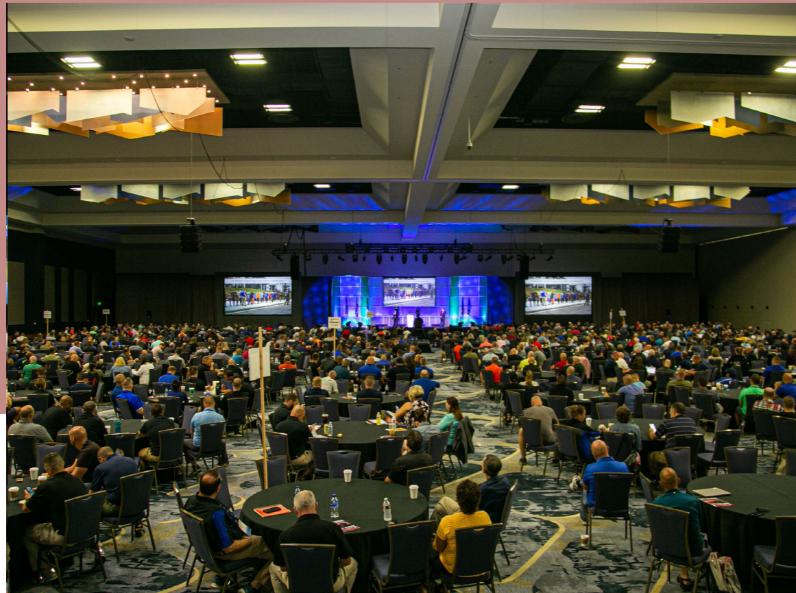
Exhibit at the NASRO School Safety Conference